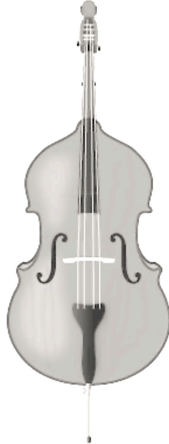
THE DOUBLE BASS

you hold it between your legs to be able to play it has a very warm sound